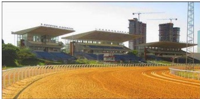
Hipódromo do Cristal