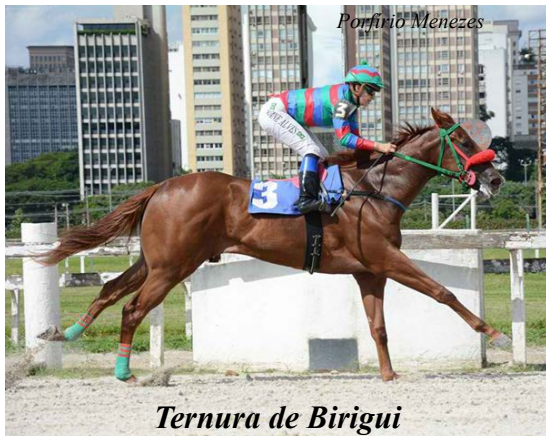
Ternura de Birigui