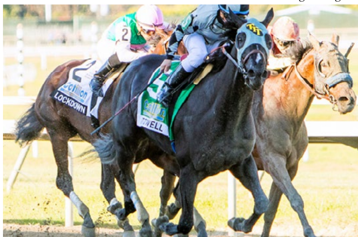
It Tiz Well