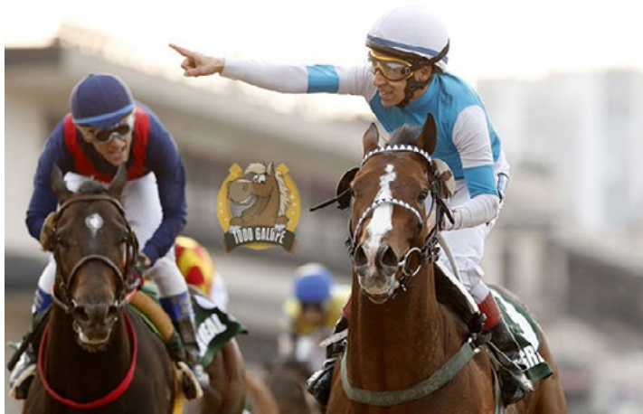
The Great Day