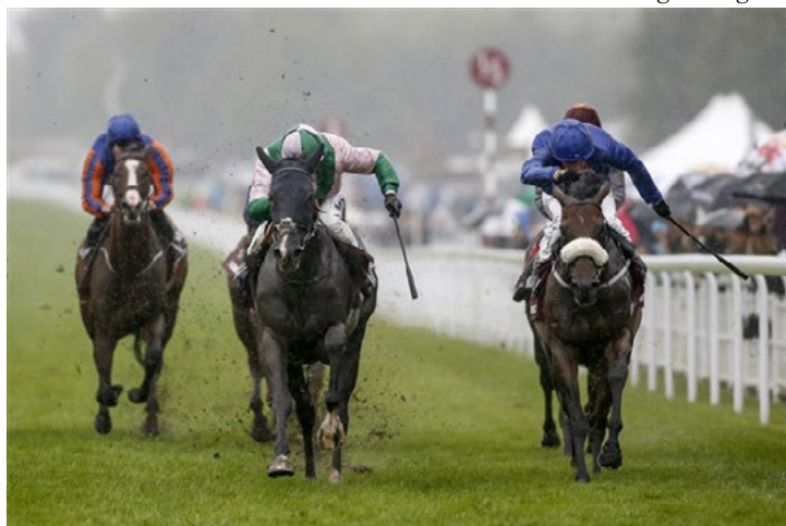
Here Comes When